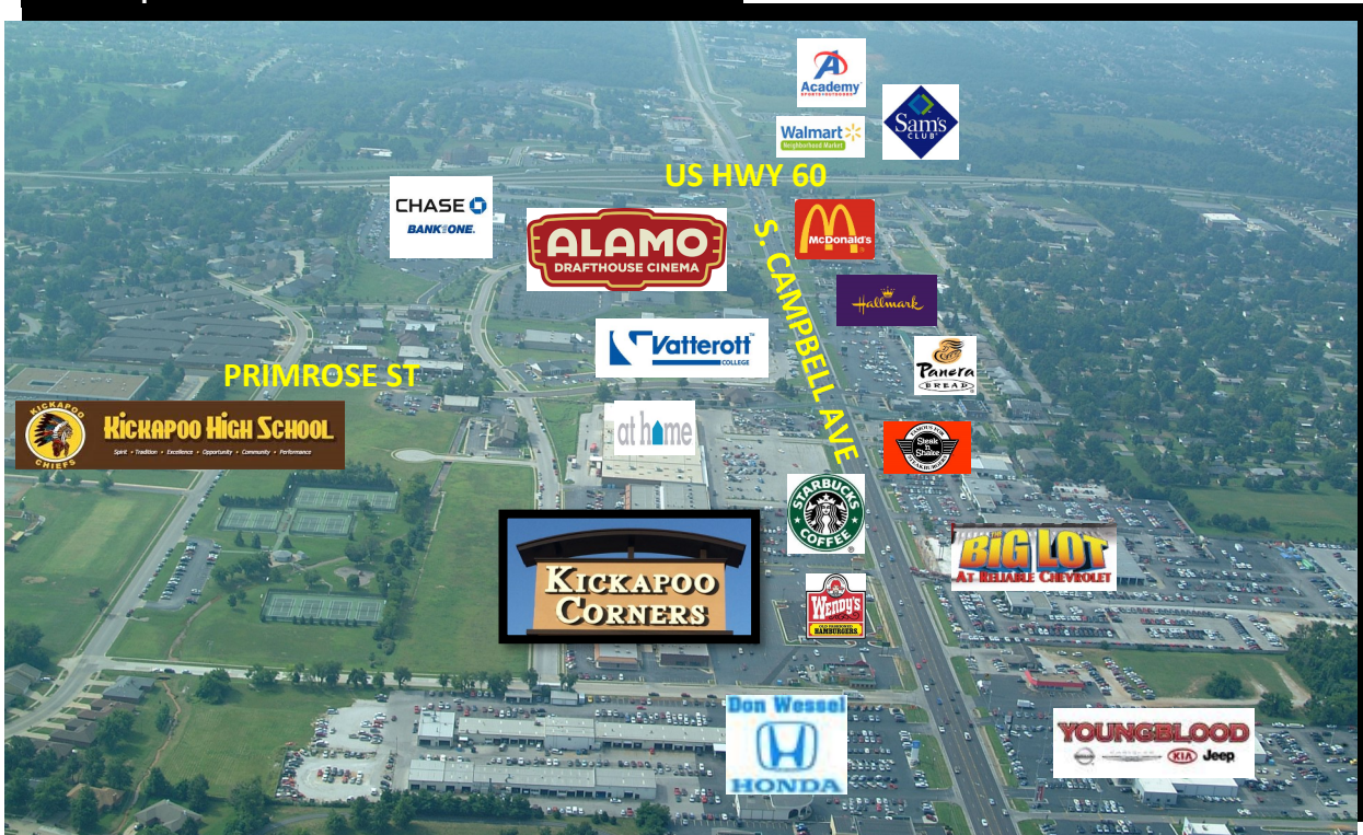
Kickapoo Corners View to the South