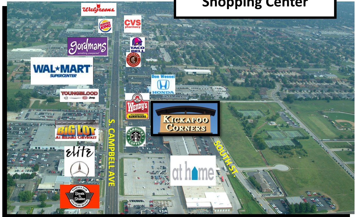
Kickapoo Corners View to the North